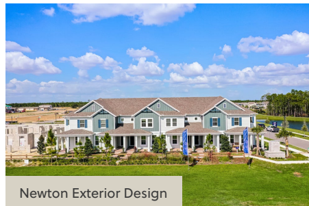
Newton Exterior Design