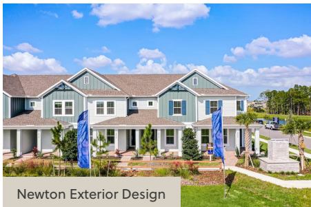
Newton Exterior Design