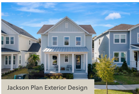
Jackson Plan Exterior Design