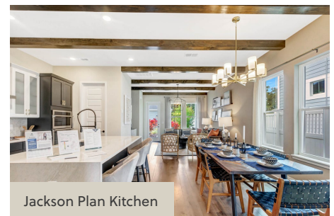
Jackson Plan Kitchen