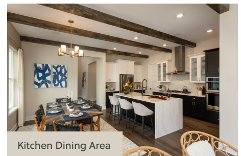
Kitchen Dining Area