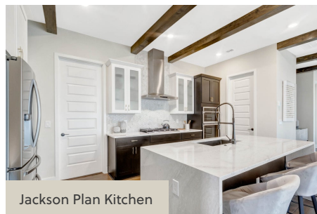
Jackson Plan Kitchen