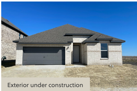
Exterior under construction