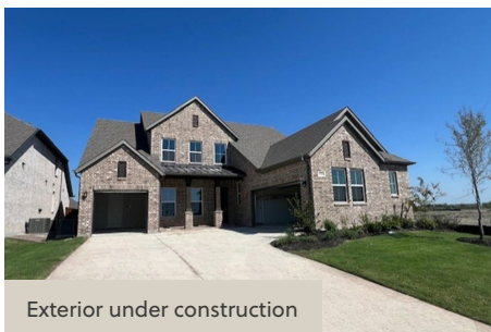
Exterior under construction