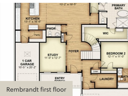
Rembrandt first floor