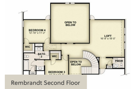
Rembrandt Second Floor