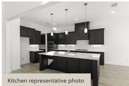
Kitchen representative photo